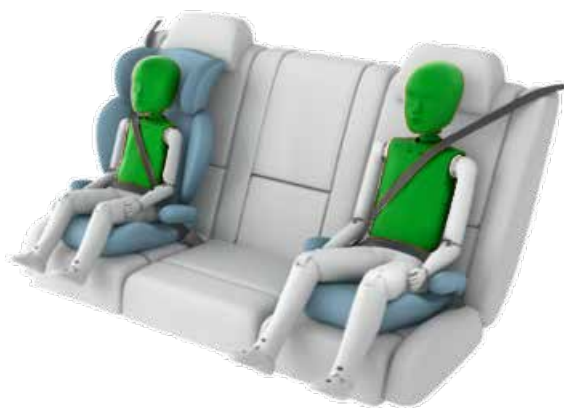
6 year old