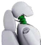
Driver / Front Passenger