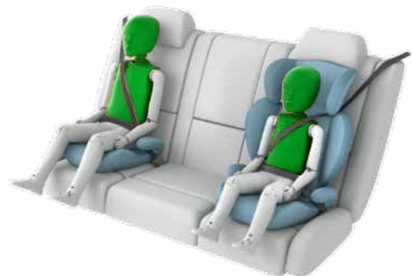
10 year old