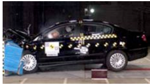
Offset crash test at 64km/h (sedan)