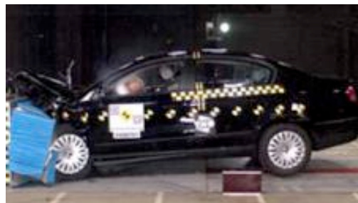
Offset crash test at 64km/h (sedan)