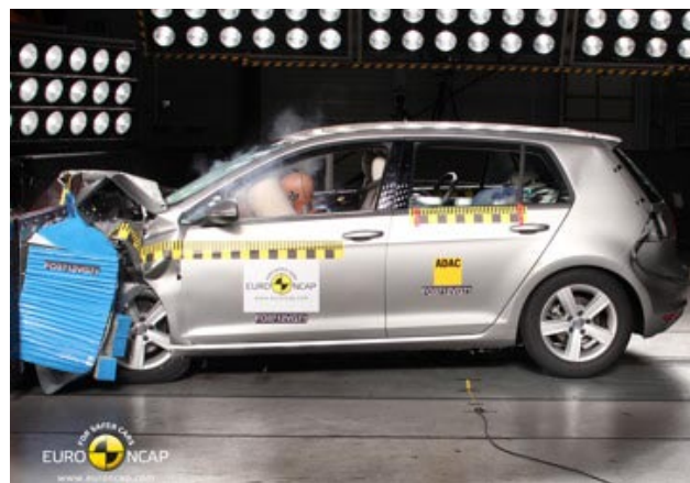
Frontal offset test at 64 km/h (Euro NCAP)

Note: The left-hand-drive European model with 1.2 petrol engine was tested by Euro NCAP. ANCAP was provided with information which showed that the Euro NCAP results apply to Australasian petrol variants.