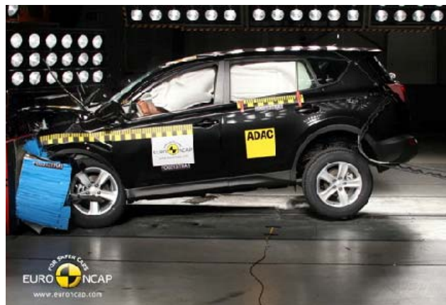
Frontal offset test at 64 km/h

Note: The diesel left-hand-drive European model was tested by Euro NCAP. ANCAP was provided with information which showed that the Euro NCAP results apply to all Australasian variants.