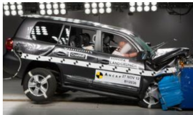
Frontal offset test at 64 km/h