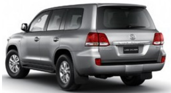
Toyota Landcruiser GX / GXL