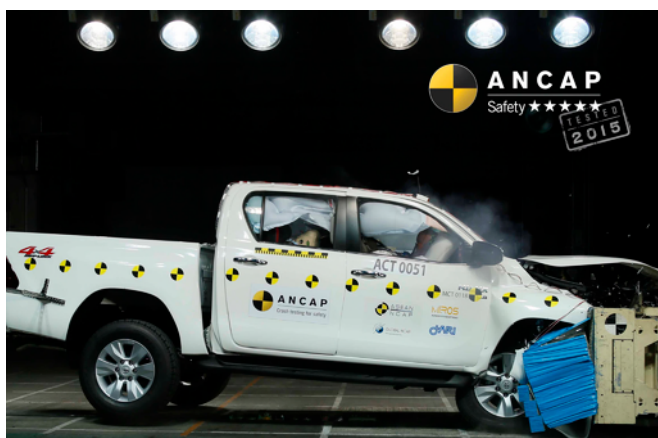
Frontal offset test at 64km/h