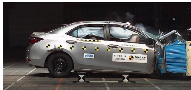
Frontal offset test at 64 km/h