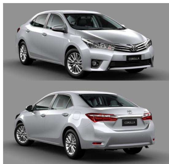
Toyota Corolla Sedan

There are many areas with adequate head protection and good lower leg protection. Some improvement is required for upper leg protection. (v6.0)