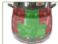
Child and adult head impact