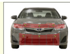
Adult leg impact (upper and full legforms)