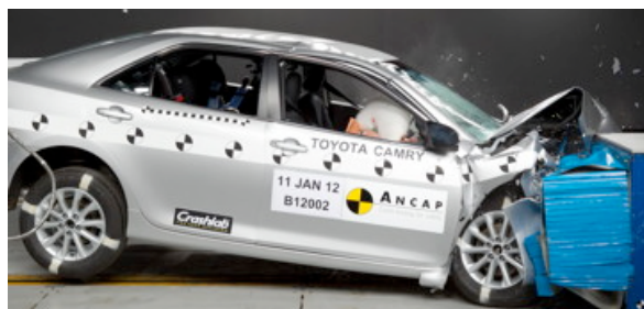
Offset crash test at 64km/h (Camry)