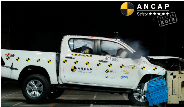
Frontal Offset test at 64km/h (Toyota Hilux tested)