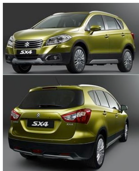
Suzuki SX4 S-cross