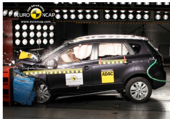
Frontal offset test at 64 km/h (Euro NCAP)

Note: The petrol front-wheel-drive left-hand-drive European model was tested by Euro NCAP.