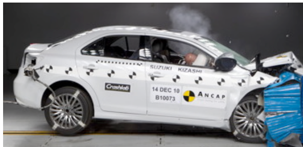
Offset crash test at 64km/h