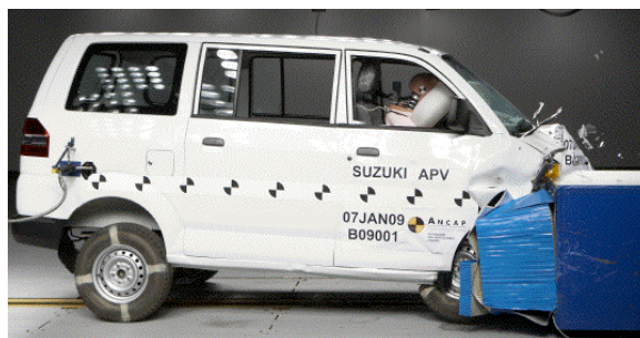
Offset crash test at 64km/h