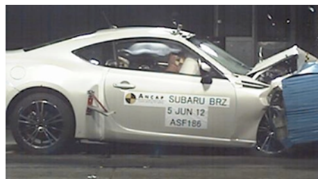
Offset crash test at 64km/h