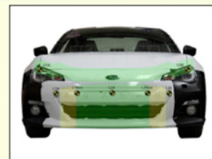
Adult leg impact (upper and full legforms)