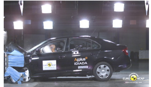
Frontal offset test at 64 km/h (Euro NCAP)