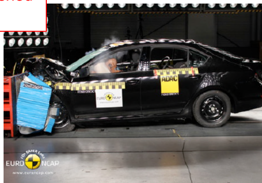
Frontal offset test at 64 km/h

Note: The diesel left-hand-drive European model was tested by Euro NCAP. ANCAP was provided with information which showed that the Euro NCAP results apply to all front-wheel-drive variants.