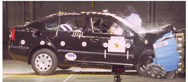
Offset crash test at 64km/h