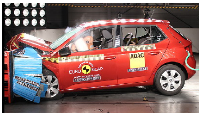
Frontal offset test at 64km/h (Euro NCAP)