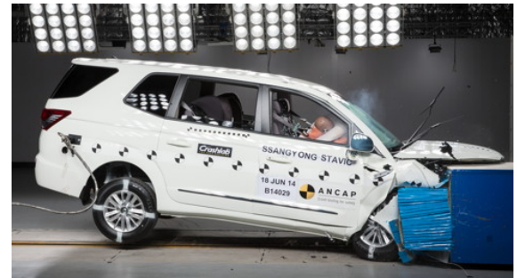
Frontal offset test at 64 km/h