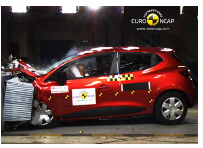
Frontal offset test at 64 km/h (Euro NCAP)

Note: The diesel left-hand-drive European model was tested by Euro NCAP. ANCAP was provided with information which showed that the Euro NCAP results apply to all Australasian variants.