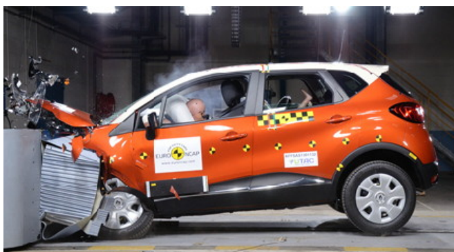
Frontal offset test at 64km/h (Euro NCAP)