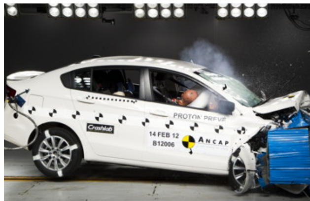
Frontal offset test at 64 km/h (Proton Preve pictured)