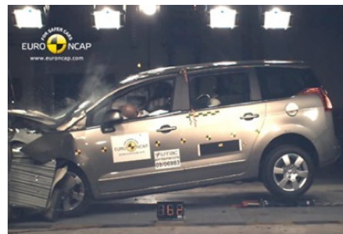
Frontal offset test at 64 km/h

Note: The 1.6 litre diesel left-hand-drive European model was tested by Euro NCAP. ANCAP was provided with information which showed that the Euro NCAP results apply to all Australasian variants