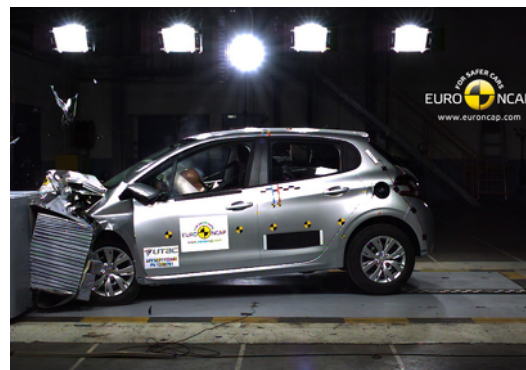
Frontal offset test at 64 km/h (Peugeot 2008 tested by Euro NCAP)

Note: The diesel left-hand-drive European Peugeot 208 was tested by Euro NCAP. Euro NCAP was provided with data that showed the crash test results also apply to the 2008, which is built on the same platform.