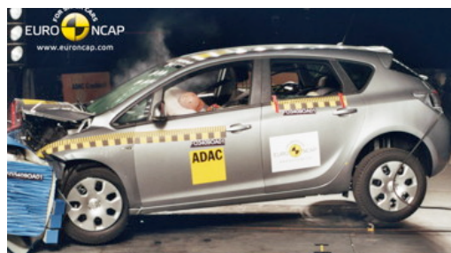
Offset crash test at 64km/h (Euro NCAP)