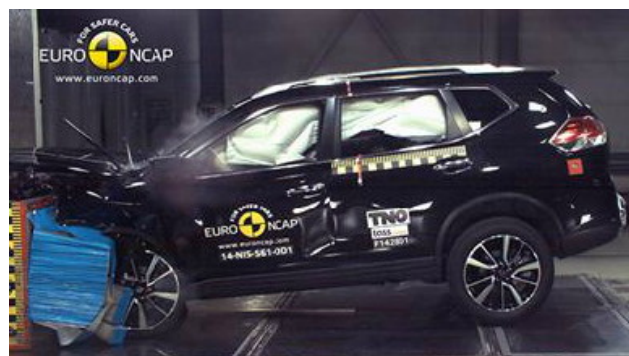
Frontal offset test at 64 km/h (Euro NCAP)

Note: The diesel left-hand-drive European model was tested by Euro NCAP. ANCAP was provided with information which showed that the Euro NCAP results apply to all Australasian variants.