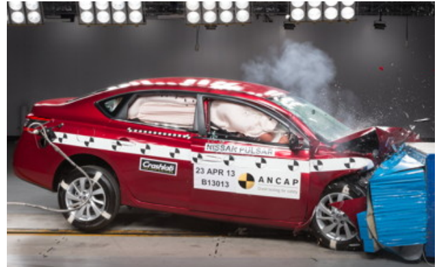
Frontal offset test at 64 km/h