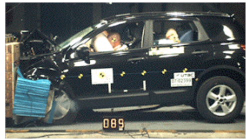
Offset crash test at 64km/h