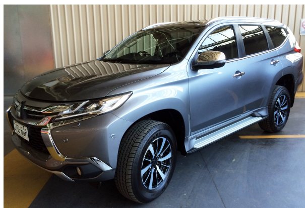
Mitsubishi Pajero Sport