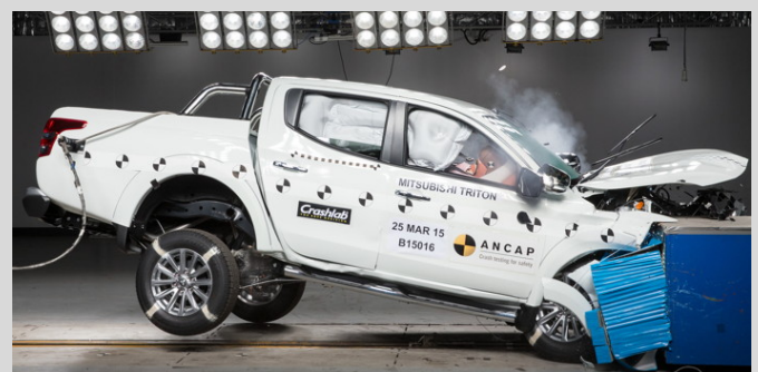
Mitsubishi Triton Frontal offset test at 64km/h