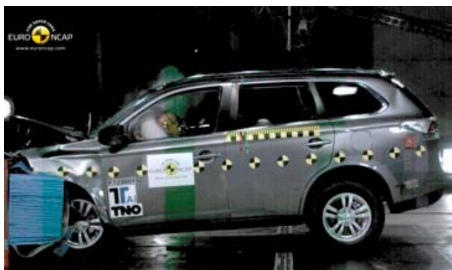
Frontal offset test at 64km/h