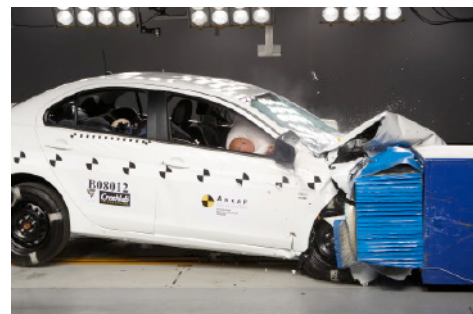
Frontal offset test at 64 km/h