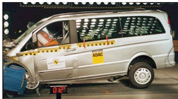
Offset crash test at 64km/h (Viano)