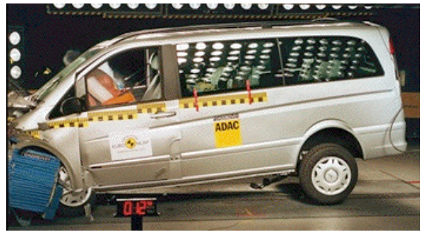
Offset crash test at 64km/h (Euro NCAP)