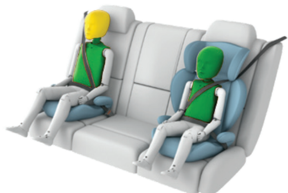
10 year old