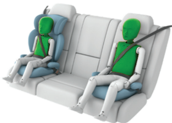
6 year old