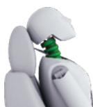
Driver / Front Passenger