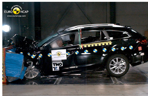
Frontal offset test at 64 km/h (Euro NCAP)

Note: The diesel left-hand-drive European wagon was tested by Euro NCAP. ANCAP was provided with information which showed that the results apply to all Australasian variants.