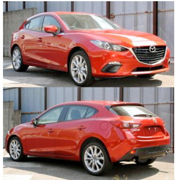
Mazda 3 hatch

The bumper scored maximum points for the protection provided to pedestrians' legs. However, the protection provided by the front edge of the bonnet was predominantly poor. The bonnet surface showed good or adequate protection over most of its surface, with poor results recorded on the stiff windscreen pillars.