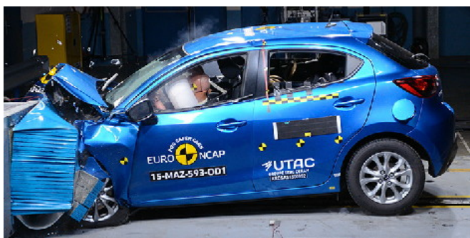
Frontal offset test at 64km/h (Euro NCAP)