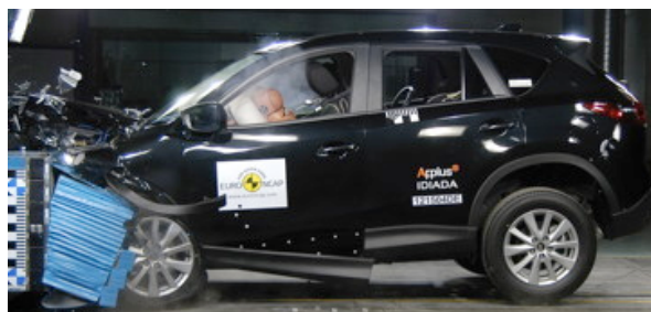
Offset crash test at 64km/h