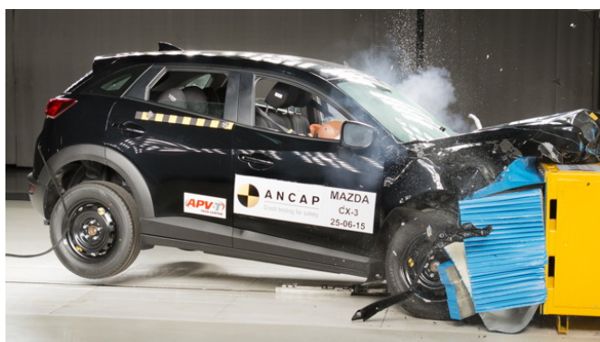
Frontal offset test at 64km/h (Euro NCAP)