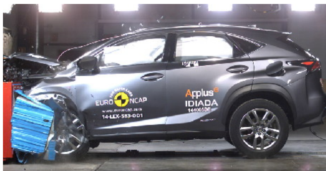
Frontal offset test at 64km/h (Euro NCAP)