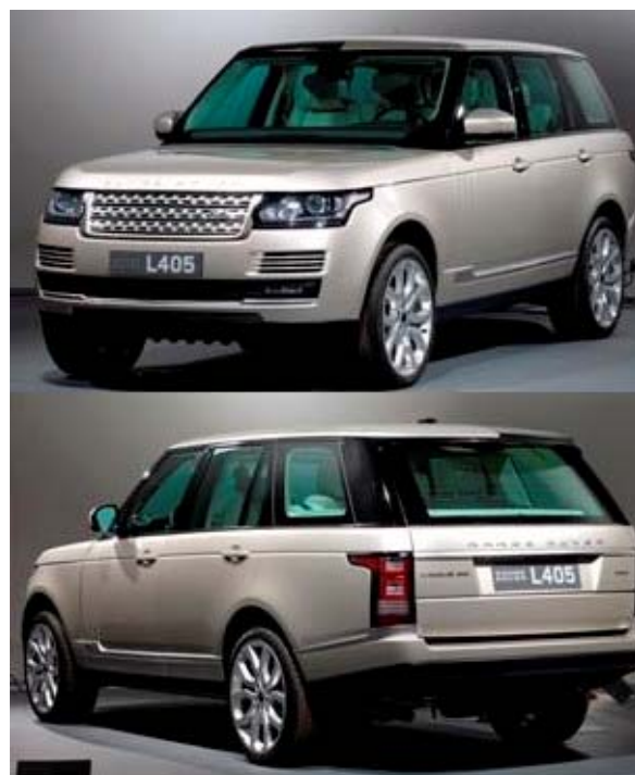
Land Rover Range Rover