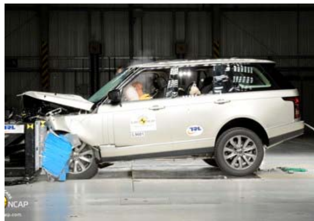
Frontal offset test at 64 km/h (Euro NCAP)

Note: This rating is based on crash tests of the TDV6 diesel left-hand-drive European model by Euro NCAP.