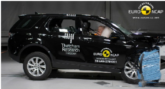
Frontal offset test at 64km/h (Euro NCAP)