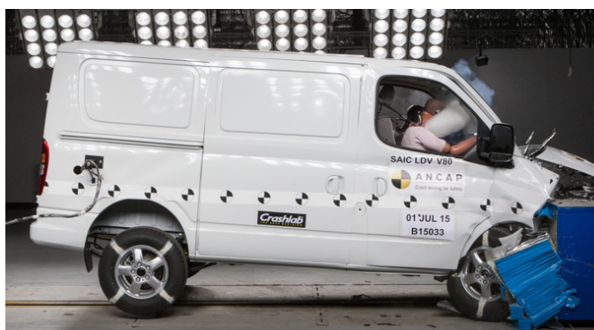
Frontal offset test at 64km/h