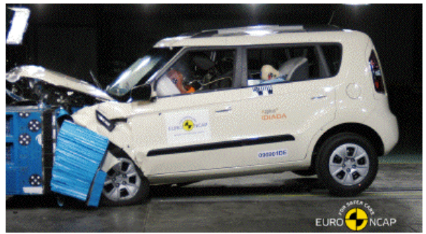
Offset crash test at 64km/h