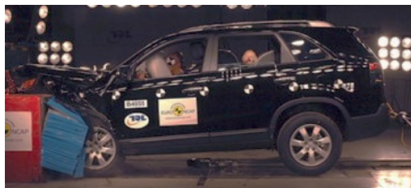
Offset crash test at 64km/h (Euro NCAP 2009)