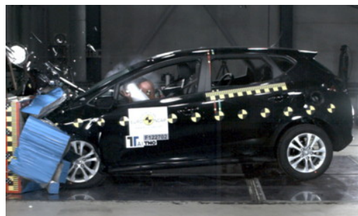
Frontal offset test at 64 km/h (5 door hatch - Euro NCAP)

Note: The left-hand-drive Cee'd 5 door hatch was tested by Euro NCAP. ANCAP was provided with information which showed that the Euro NCAP results apply to the Australasian pro_cee'd 3 door hatch.