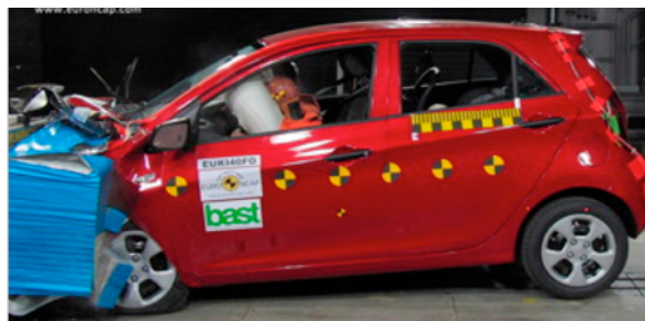
Offset crash test at 64km/h (Euro NCAP)