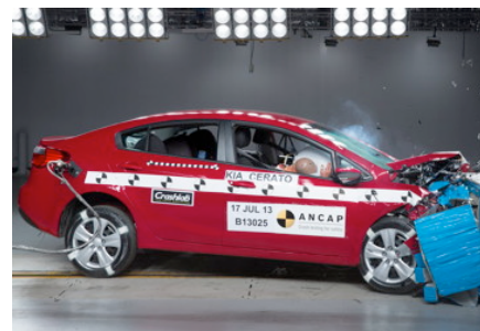
Frontal offset test at 64 km/h (ANCAP crash test of sedan)

Note: This rating is based on ANCAP crash tests of the Cerato sedan. ANCAP was provided with information which showed that the rating applies to the Cerato Koup.