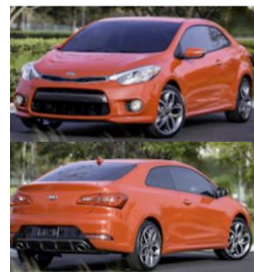
Kia Cerato Koup