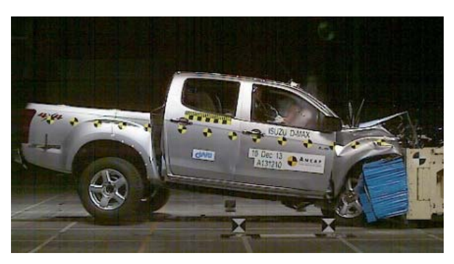
Frontal offset test at 64 km/h (D-Max utility tested by ANCAP)

ANCAP and Euro NCAP conducted crash tests of the Isuzu D-Max utility. ANCAP was provided with evidence that the results apply to the MU-X sports utility vehicle, which is based on the same platform as the D-Max.